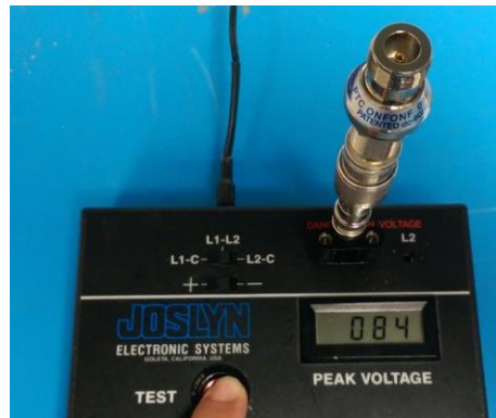
Sample NexTek Test Setup

For +5V rated units, the DC Voltage should rise to 5-8Vpk before the diode forms a shunt and the power supply goes into current-limiting mode.