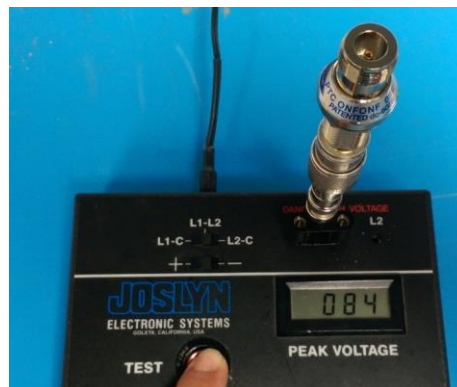
Sample NexTek Test Setup

For +5V rated units, the DC Voltage should rise to 5-8Vpk before the diode forms a shunt and the power supply goes into current-limiting mode.